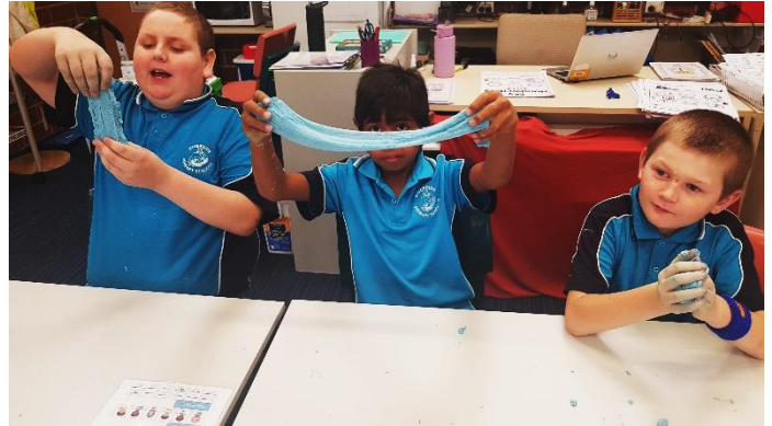
Our clever scientists explore the special properties of stretchy sand. "It is soft, sticky, squishy and stretchy."

In science classes this term we have been focusing on chemical sciences. In the senior years this has involved learning looking at different states of matter – solids, liquids, gases and some materials that aren't as easily identified. The students have been exploring different materials such as ice, water, slime, sand, and oobleck through experiments and investigations. They are also learning about 'fair' tests and how to conduct experiments by using a scientific method.