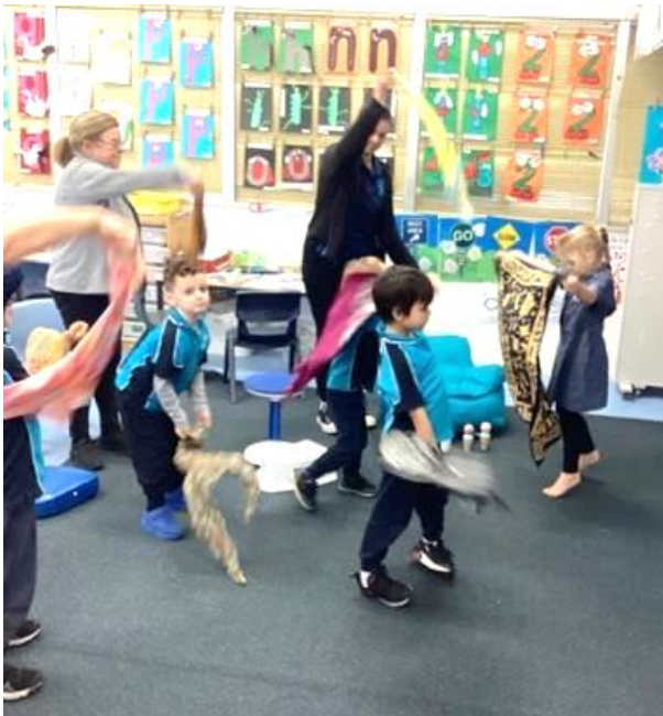
Room 35 students participating in their scarf dance. Keep up the beautiful work Room 35!