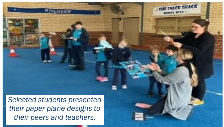
Selected students presented their paper plane designs to their peers and teachers.