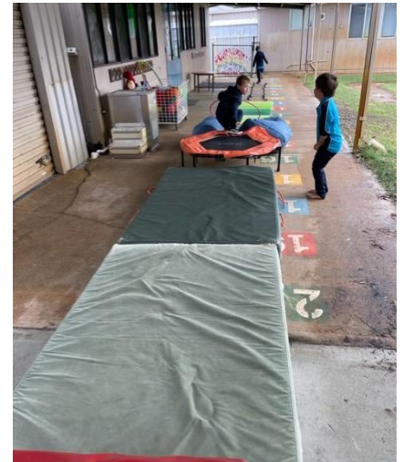
Kindy kids enjoying a verandah obstacle out of the rain.