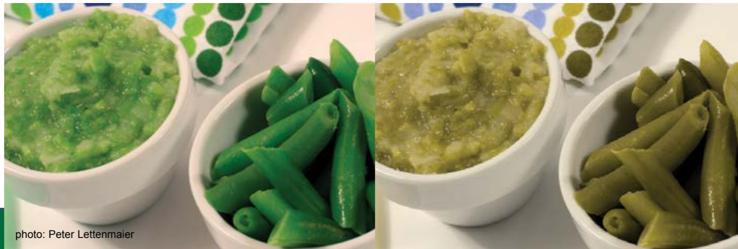
Some foods, particularly green vegetables, can look repulsive to colour blind children.